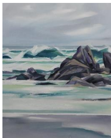
Incoming Tide £350