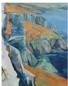
Autumn Bracken £350