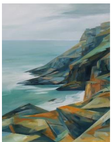
Trewavas Cliffs £350