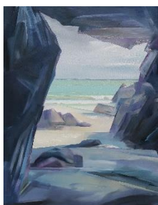
Steatite Cave £350